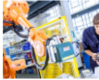
Automated Part Marking