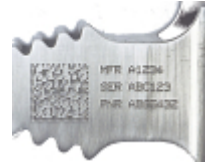
Aerospace Marking Standards