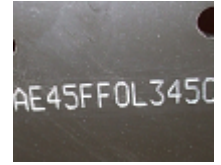
Automotive VIN Marking