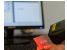
Production Data Monitoring