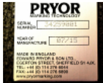
Serial Number Marking