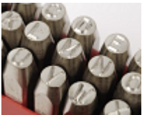
Hand Tools for Marking & Identification