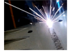
Automotive VIN Marking