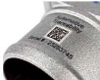
Serial Number Marking