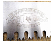
Logo Marking Solutions