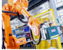
Automated Part Marking