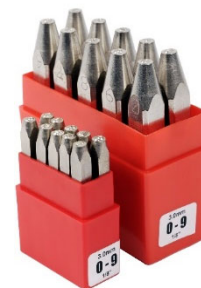
Goliath Punches (right) compared to Premium Punches (left)